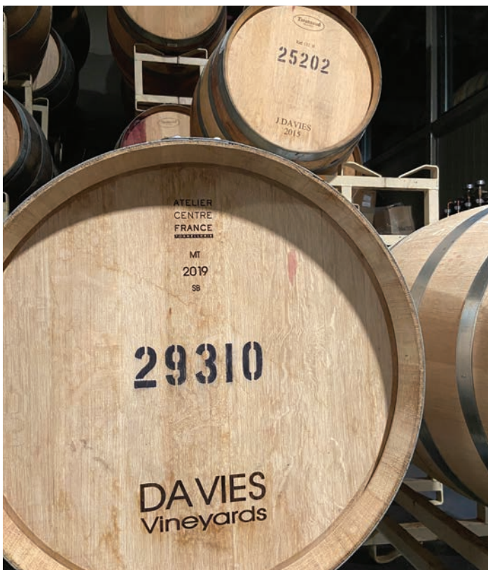
French oak barrels resting in the newly renovated Davies Vineyards barrel room.

Spring has sprung! The start of a new growing season is always exciting and who doesn't love seeing sunshine and green hills when they come to the valley? We're very much looking forward to the 2020 vintage. We've also been looking at our 2019s and personally, I'm excited to see how these red wines evolve over the next couple of years. Part of these evaluations is looking at the oak program we've implemented and how the wines from each site taste across the different coopers and their barrels. In the same way that we enjoy working with multiple blocks and multiple clones from each site, we enjoy having options for our barrel program. With our barrel orders being placed in the spring, well before the vines have even flowered or fruit has set, we have to balance previous experience with a desire to experiment and push ourselves while making choices for the upcoming vintage. The different forest sources, toast levels, and the overall house style for each cooper gives us different components to work with when it comes to blending. The barrels help lift aromatics, build midpalate weight, and to enhance the inherent character of the wines we're working with. The blend of new oak and used oak gives us a multitude of options when we're assembling the final blends for the wines.