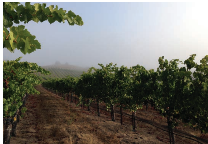
The Nobles Vineyard, Sonoma Coast, enrobed in morning coastal fog.