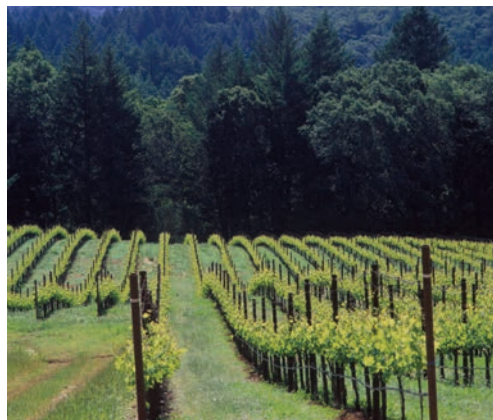
J. Davies Estate Diamond Mountain Vineyard in spring.