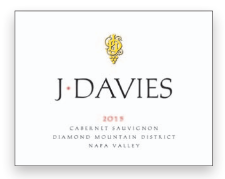
2015 J. Davies Cabernet Sauvignon Diamond Mountain District

(The Davies Club will receive 2 bottles of the 2015 J. Davies Cabernet Sauvignon for $145*) (Jack & Jamie's Circle will receive 2 bottles of 2015 J. Davies Cabernet Sauvignon and 2 bottles of the 2014 Jamie Cabernet Sauvignon for $410*)