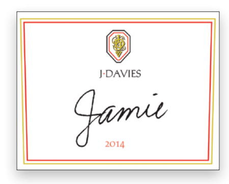
2014 J. Davies "Jamie" Cabernet Sauvignon Diamond Mountain District

Tasting Notes - "This wine holds perfumed aromas of dark red cherry, dried strawberry, raspberry and rose petal combined with violet, black tea and coffee. Dense concentrated fruit flavors of black currant, black cherry and mint mingle effortlesly with dark chocolate and are seamlessly brought together with a well-structured, rich mid-palate."