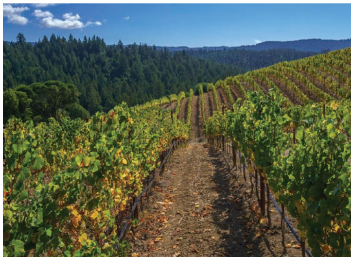
The Goorgian Vineyards, Anderson Valley.

VARIETAL COMPOSITION: 98% Cabernet Sauvignon, 2% Malbec BARREL AGING (FRENCH OAK): 24 months (61% new) ALCOHOL: 14.3% SUGGESTED RETAIL: $185