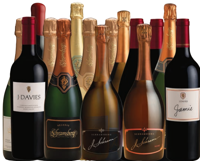
Instant Wine Cellar